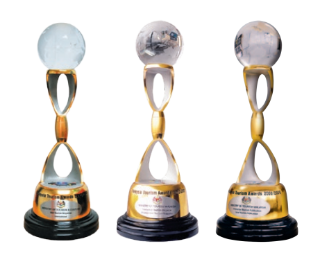
Three-time winner of "Best Tourism Magazine" at the biennial Malaysia Tourism Awards

Its widespread distribution enables Senses of Malaysia to reach a conservative estimate of over 100,000 readers every issue, making it a highly effective vehicle for companies wishing to promote their products and services to affluent Malaysians, international tourists, and foreign investors. The distribution channels include copies placed in selected Malaysia Airlines flights, including the first and business class seat pockets. Additionally, hundreds of copies are directly provided to the CEOs and MDs of companies throughout Malaysia. Other copies are placed in the rooms, suites, and executive lounges of upmarket hotels, as well as in embassies, golf courses, and other upscale venues. Additional copies are further sold through bookstores and subscriptions.